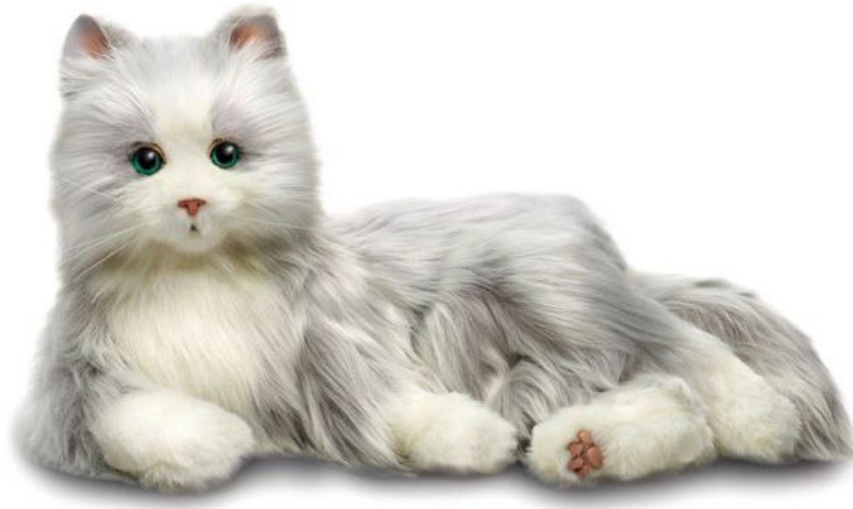
Figure 1: The ‘Ageless Innovation’ companion cat

This product is marketed specifically for older people, and “... with a focus on improving quality of life for aging loved ones, their families, and caregivers” (“Ageless Innovation”, 2019). The cat vocalizes with meows and purrs in reaction to light and touch, via its on-board sensors. It moves its mouth, eyes, head and also rolls over, again in response to human interaction. Strictly speaking, it is not a robotic device, as in its off-the-shelf form, it is not programmable. However, it operates in two modes: mute or sound. In both modes, the cat’s movements continue to function. It is battery-powered, and the researchers have tested that the replaceable battery life is long (months, not weeks).