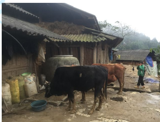
15 16 Photo No.1 – A Resourceless Agriculture Peasant Farming (Lao Chai Village) 17 18

33  34 35