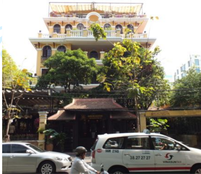
11 Photo No. 3 – Resourceful Entrepreneurs - Taxi and Chauffeur Businesses (Hanoi) 12

32  33 34