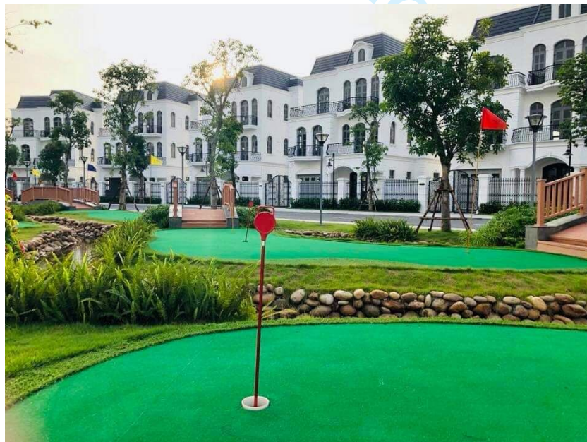
35 Photo No. 4 - Resourceful Entrepreneurs – Real-Estate and Golf Businesses (Hanoi) 36 37

58  59 60