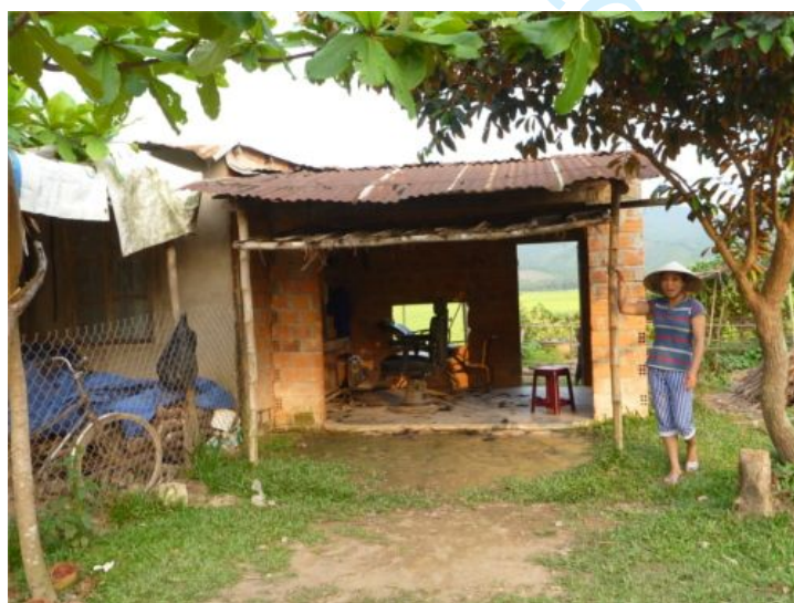
36 Photo No. 2 – A Destitute Barbershop Business (Binh Ning village) 37 38

57  58 59 60